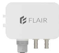
Differential Pressure Sensor