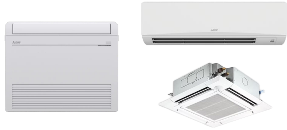
Mitsubishi Ductless Heat Pumps