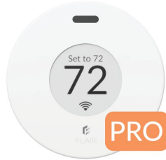
Flair Puck Pro