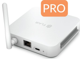
Flair Bridge Pro